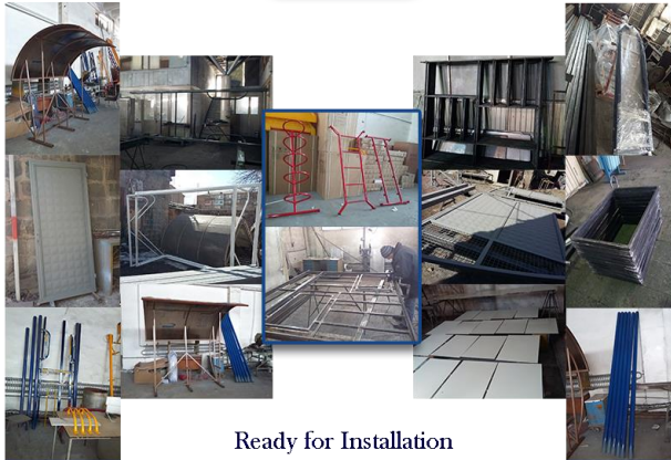
Ready for Installation