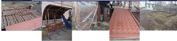
Installation in Process