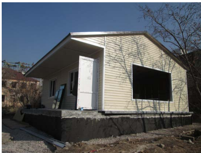
Family Suite at Dzorak Care Center